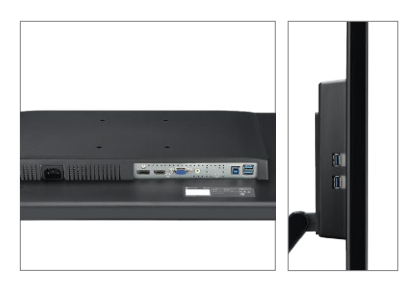
Versatile connectivity: VGA, HDMI, DisplayPort and USB port allow for effortless system integration