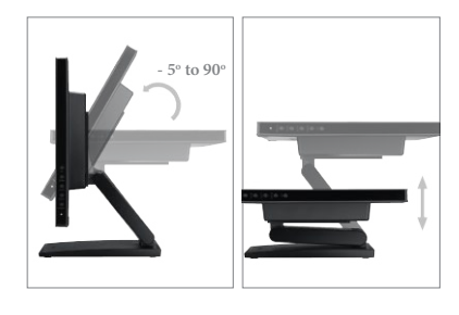
Flexible dual-hinge stand design to maximise viewing comfort for multiple users