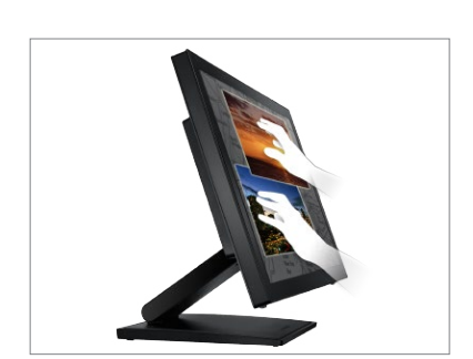
Integration of 10-point touch and projected capacitive touch technology provides accurate and precise touch experience