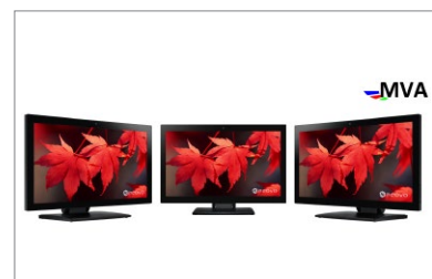
MVA panel provides superb clarity from all viewing angles