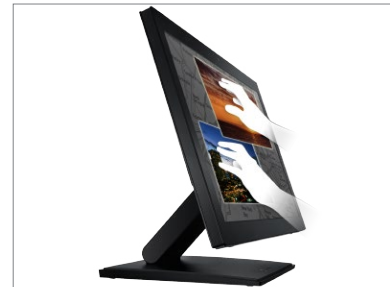
Integration of 10-point touch and projected capacitive touch technology provides accurate and precise touch experience