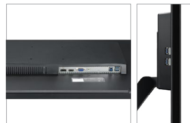
Versatile connectivity: VGA, HDMI, DisplayPort and USB port allow for effortless system integration