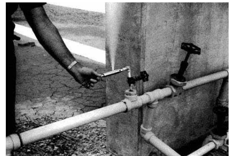
Valve Applied to Transfer Line