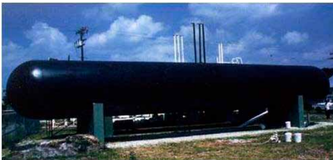
Valve Application on Tank