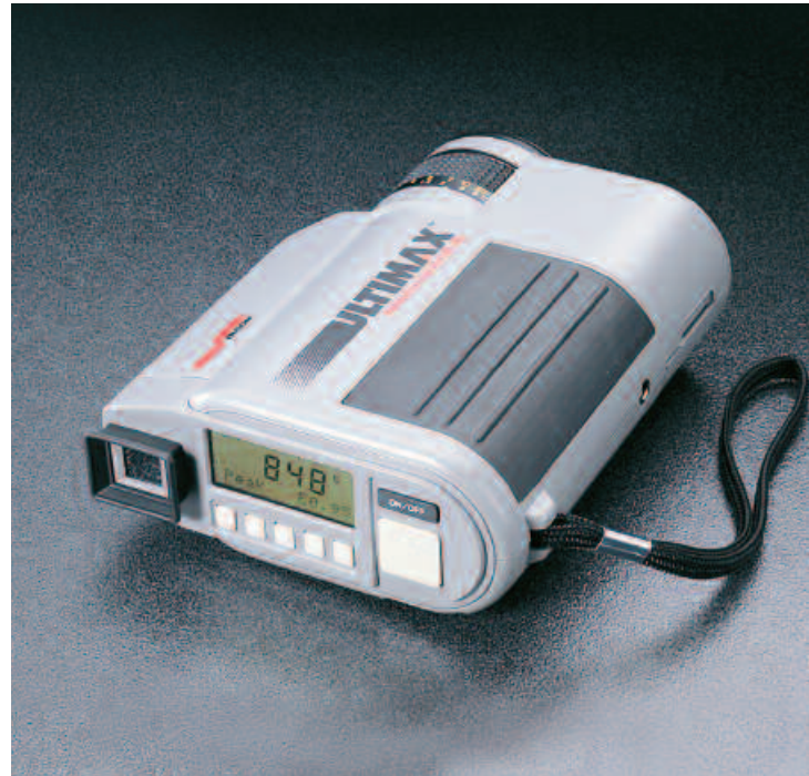
Models UX 10P, UX 20P, and UX 40P