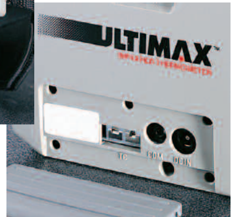
Models UX 50P, UX 60P, and UX 70P

to maintenance. No matter what your application, ULTIMAX Plus thermometers ensure consistent delivery of high quality finished products. For complete product details, please see the specification chart.